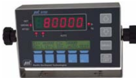
9700 Digital Indicator