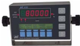
9700 Digital Indicator